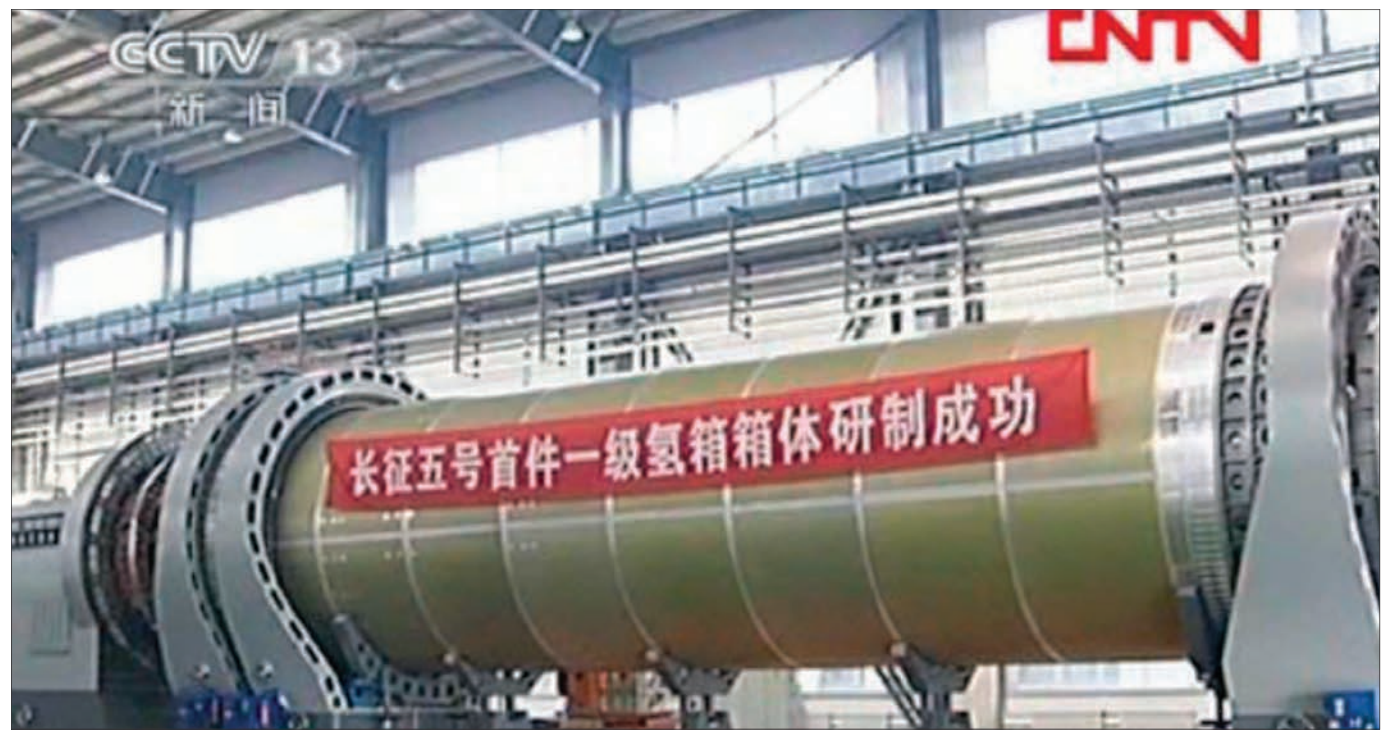
The LM-5 first stage hydrogen tank is part of a breakthrough in Chinese rocket design.

for the country's manned space and lunar probe missions. This high-performance engine is nontoxic, pollution-free and reliable.