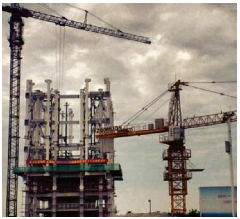
The Wenchang launch site will be open to the public and serve as a space education base.

With a new coastal launch facility for larger boosters and spacecraft, China also needed a new coastal site for fabricating them. Through a selection process that has never been described, officials settled on the city of Tianjin (http://www.tj.gov.cn/english/), more familiar to Westerners under its old