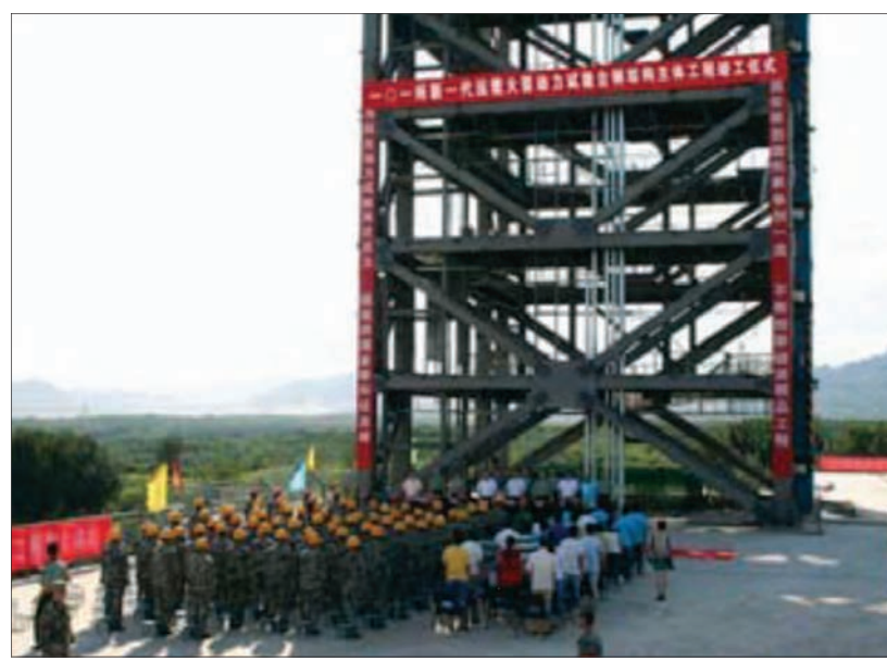
A static load test facility was one of the structures built for the Tianjin test center.

Ma Xingrui, general manager of CASC, which designs and manufactures the Long March rocket series and Shenzhou manned spacecraft, described the facility to Xinhua in September 2011. Called the Tianjin Aerospace Industry Base, it covers an area of 313.33 hectares and cost over 6 billion yuan ($938 million), according to CASC. It includes a 220,000-m<sup>2</sup> assembly building for the launch vehicles, space stations, and "special equipment" (presumably other large satellites).